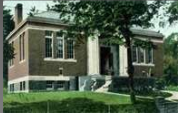
Carnegie Library-Arts & Technology Center

The arts are driving the revitalization of midtown through the adaptive reuse of formerly abandoned industrial sites – this resurgence of commercial and artistic life has reversed decades of negative growth. Here in Midtown we are seeing a resurgence in positive growth, thanks to the arts community. The former shirt factory is home to a group of entrepreneurs and artists, including painters, dress designers, woodworkers, stained glass, dance, performing arts, photographers, web design and sound mixers. Over 40 tenants form a creative community where tenants can collaborate and network. The Center for Creative Education is restoring the former Carnegie Library right next to the High School which has been vacant for over thirty years. The building will have two large performing arts studios and a complex of arts technologies, including the Kingston High School television station, a podcasting studio, video and recording facilities, and a small stage.