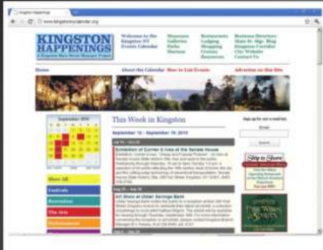
Online Events Calendar