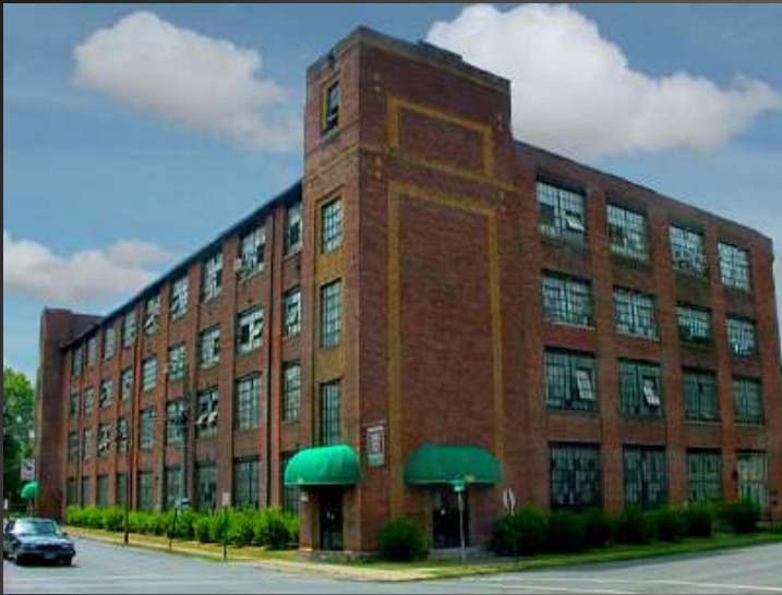
Shirt Factory- Artist Lofts